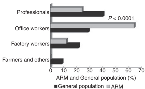
Figure 2 Comparison of occupational status. ARM, anorectal malformation.

higher rate of diploma, graduate and postgraduate qualifications achieved ( P = 0.0069 ).